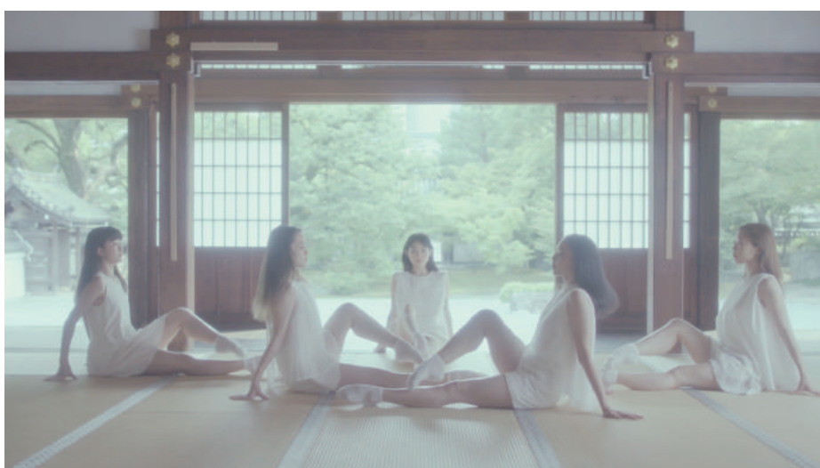
"KA · TA · O · RI · HA"

-"KA TA O RI HA" /Celebratory film made for Hakata-Ori textiles' 777th anniversary ★FUKUOKA AD ASSOCIATION PRIZE for Web Movie/GOLD ★TOP SHORTS (JUNE 2019) /Best Microfilm ★TOP SHORTS ( JUNE 2019) /Best Commercial ★SHORT to the Point (JUNE 2019) /BEST MINI SHORT ★rolling idears/WINNER ★Moondance International Film Festival /SHORT FILM WINNERS ★London International Awards (2019) /FINALIST ★Telly Awards 2020 /Craft:Directing Gold ★Telly Awards 2020 /General:Fashion&Lifestyle Gold ★Telly Awards 2020 /General:Branding Silver