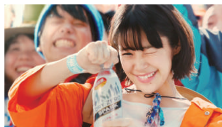
DRY ZERO SPARK" Nomitai Shunkan"