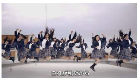
"The Greatest Showman"

PV Hakata-ori Textile Industrial Association