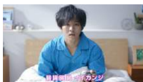
YAKULT 400 LT "INTESTINAL REVOLUTION 21"