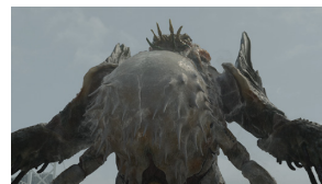
“COME ON! Kanmon!” PV Kitakyushu City, Shimonoseki City