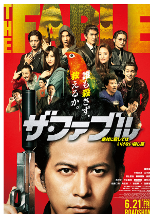
“THE FABLE” Movie ©2019 "THE FABLE" production committees