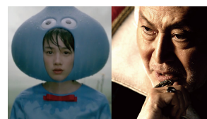
Dragon Quest Monsters: Super Light “Nakama ni shiteyo” “Ryuu Toujou” etc. TV ads SQUARE ENIX Co., Ltd.