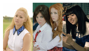
Snickers® “Soccer” “Baseball” & “Dokuzetsu Idol” etc. TV ads TM © Mars