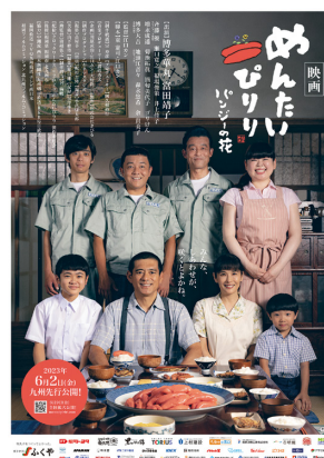
“MENTAI PIRIRI -Pansy Flowers-”