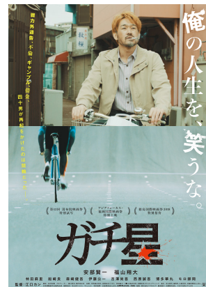
“Riding Uphill” ©2017 KOO-KI, PYLON