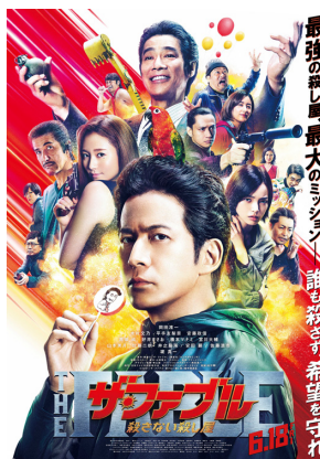
“THE FABLE : The Killer Who Doesn't Kill” Movie